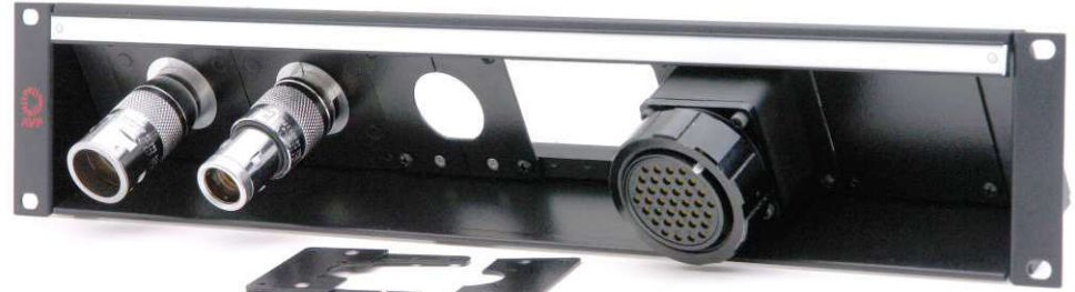
30° 6 Position Modular Bulkhead