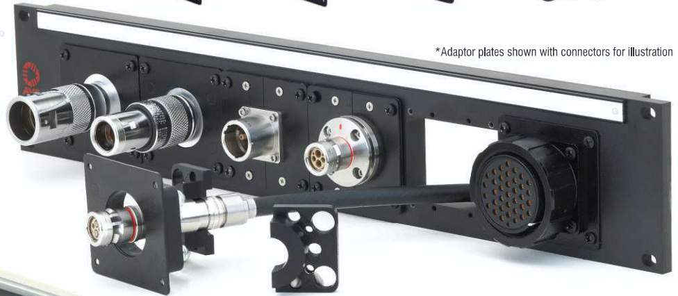
Standard 6 Position Modular Bulkhead