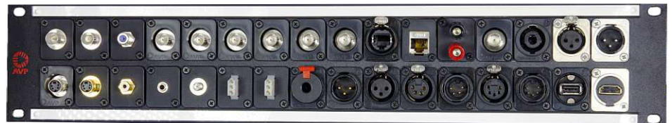
Panels shown with optional Modular Connector Kits